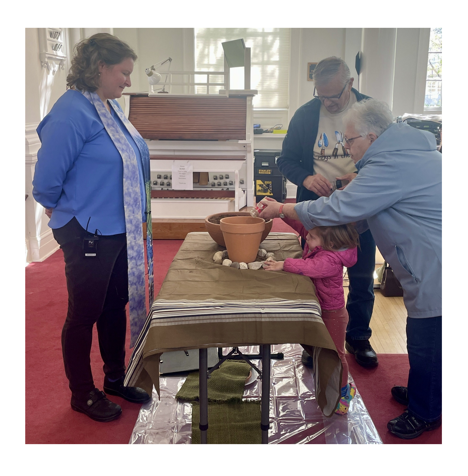
Booklet Cover "Open Doors"