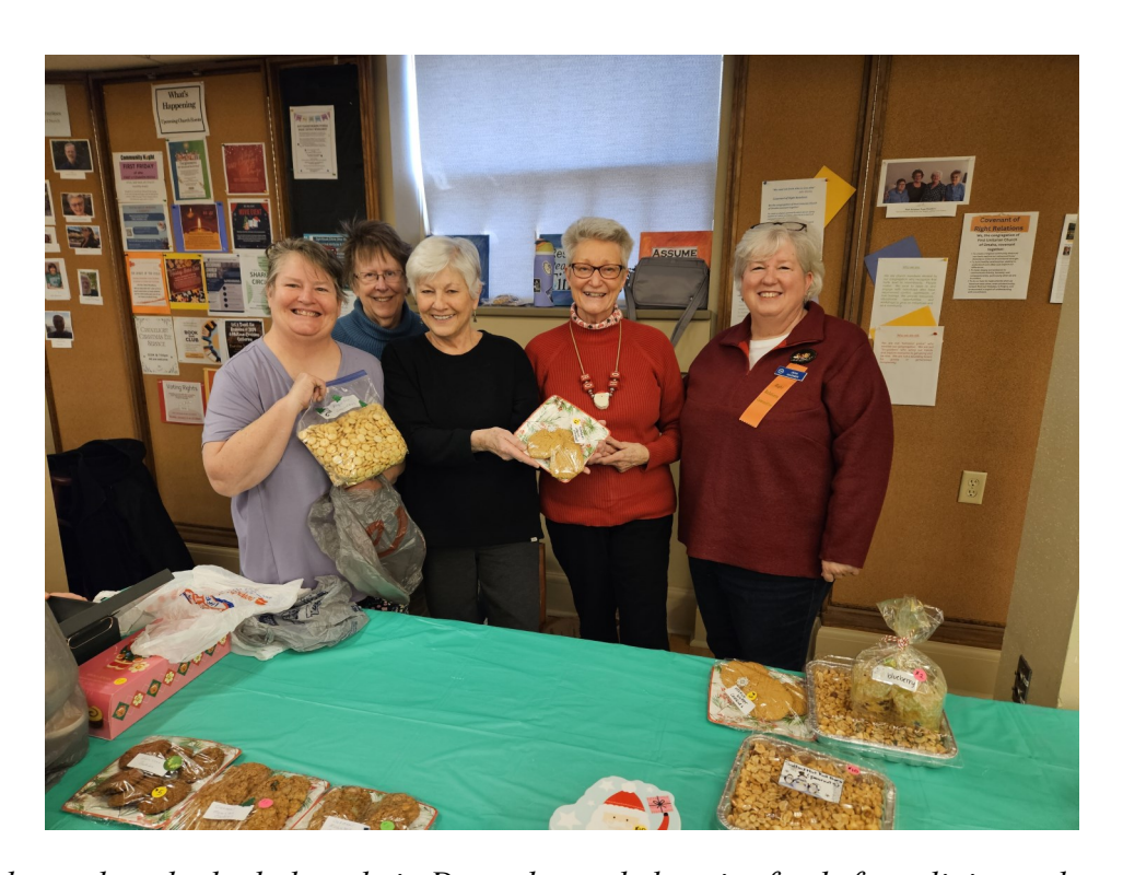
Church members had a bake sale in December to help raise funds for religious education.